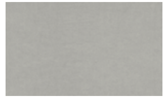
C728 100% Ply PR N/A W 138cm