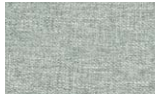
C712 100% Ply PR N/A W 140cm