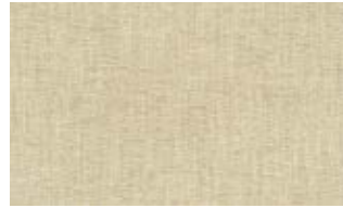
C710 100% Ply PR N/A W 140cm