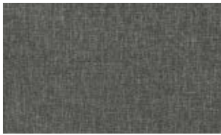
C685 100% Ply PR N/A W 140cm