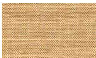
H110 Wycombe Mustard 29% Co 29% Vi 20% Ac 15% Li 7% Ply PR N/A W 140cm