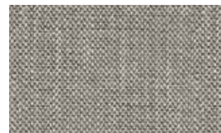
H108 Wycombe Steel 29% Co 29% Vi 20% Ac 15% Li 7% Ply PR N/A W 140cm