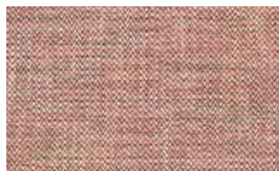
H107 Wycombe Blush 29% Co 29% Vi 20% Ac 15% Li 7% Ply PR N/A W 140cm