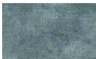
H103 Eton Atlantic 100% Ply PR N/A W 140cm