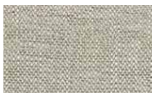
H111 Wycombe Dove 29% Co 29% Vi 20% Ac 15% Li 7% Ply PR N/A W 140cm