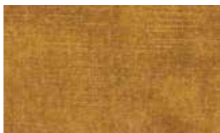
H105 Eton Ochre 100% Ply PR N/A W 140cm