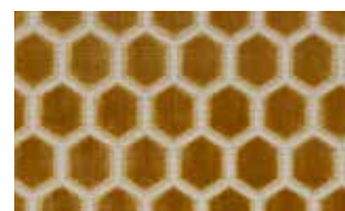
H504 Honeycomb Honey 75% Vi 25% Ply PR N/A W 140cm