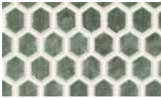
H505 Honeycomb Silver