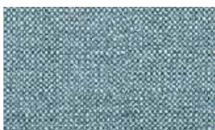
H109 Wycombe Royal 29% Co 29% Vi 20% Ac 15% Li 7% Ply PR N/A W 140cm