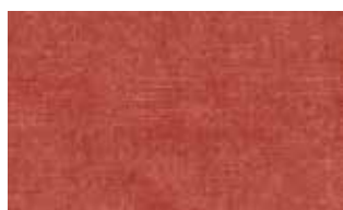
H101 Eton Coral 100% Ply PR N/A W 140cm