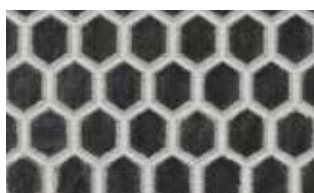
H501 Honeycomb Charcoal 75% Vi 25% Ply PR N/A W 140cm