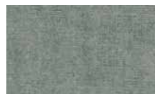
H104 Eton Slate 100% Ply PR N/A W 140cm