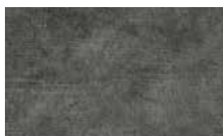
H102 Eton Asphalt 100% Ply PR N/A W 140cm