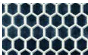
H503 Honeycomb Navy 75% Vi 25% Ply PR N/A W 140cm