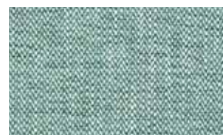
H112 Wycombe Teal 29% Co 29% Vi 20% Ac 15% Li 7% Ply PR N/A W 140cm