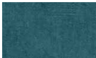
H106 Eton Ocean 100% Ply PR N/A W 140cm